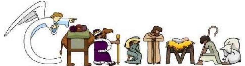
CHRISTMAS IS THE CELEBRATION OF THE BIRTH OF JESUS, THE SAVIOUR OF MANKIND

Sunday School 10 am (Sept - May 21) Office Hours 8 - 11:30 am, 12:30 - 3:00pm (M-Th) Bulletin deadline 9 am Wednesdays